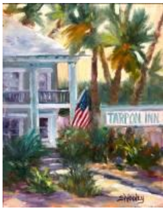
Tarpon Inn