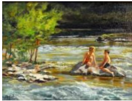
Boys of the Guadalupe River by Sherry Wooley