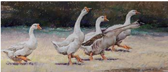
Beak and Foot Race