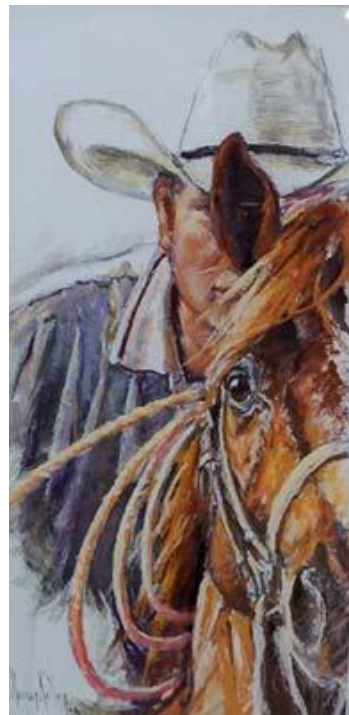
A Texas Team